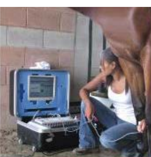
funding industry research