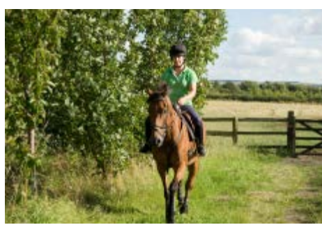
Changes in diet and stabling often occur at the same time as changes in activity which can also impact your horses risk of colic.

Learn more ways to prevent colic - sign up for Equine Guelph's Advanced Health through Nutrition 12-week online course- Jan 2014