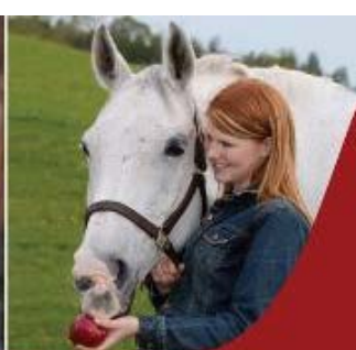
promoting health & performance